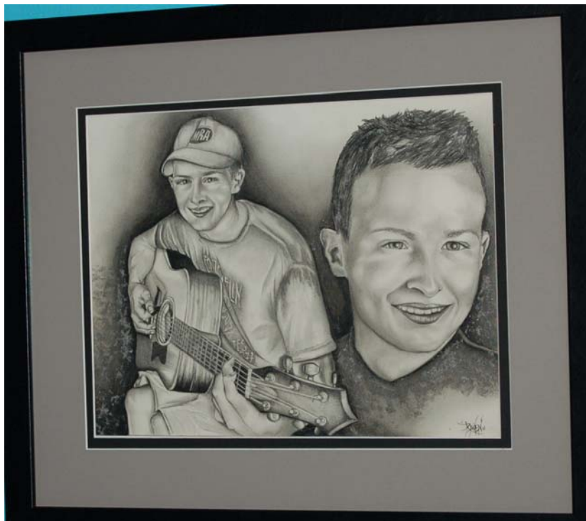
Portraits from Ashes by Raven