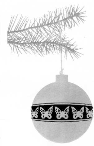
The message printed on the inside bottom front of the card: